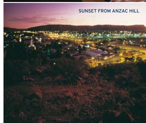
SUNSET FROM ANZAC HILL