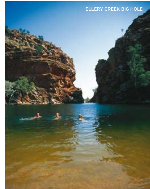
ELLERY CREEK BIG HOLE

Take the scenic walk to a nearby cemetery where workers from the Station in the 1800s are buried, before making your way home.