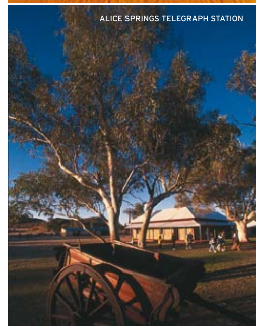
ALICE SPRINGS TELEGRAPH STATION