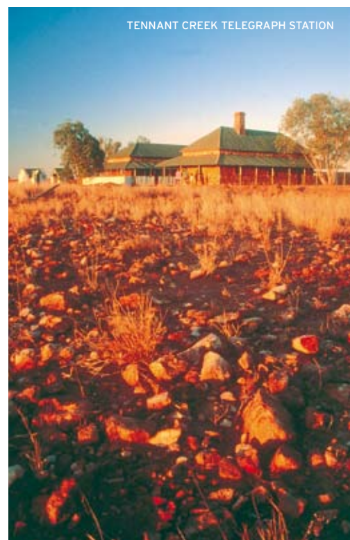
TENNANT CREEK TELEGRAPH STATION

For lunch, head to Jajjikari Cafe in the Nyinkka Nyunyu Art and Culture Centre. Nyinkka Nyunyu offers travellers an opportunity to learn about Aboriginal life, history and land in the region. Explore the displays that encompass art, kinship relationships, bush medicine and dioramas depicting the modern history of the local Aboriginal people.