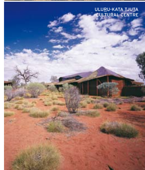
ULURU-KATA TJUTA CULTURAL CENTRE